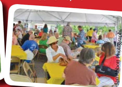
The crowd kept cool under our tent.