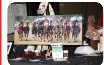
John May Photography

Thank You To Our Generous Concrete Ball Sponsors