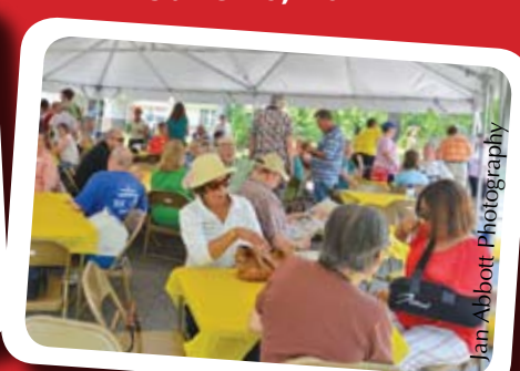
The crowd kept cool under our tent.