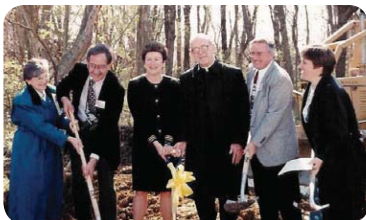
Day Spring Illinois Avenue groundbreaking ceremony for the Men and Women's Homes, April, 1994.

And all of the numerous volunteers who helped in preparing this wonderful event!